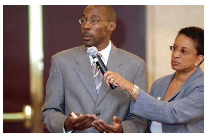
Forum attendee questions panelists about next steps for helping returning ex-offenders gain housing, transportation opportunities.

Life after incarceration isn't easy. Housing, transportation, and illiteracy are significant barriers ex-offenders must conquer as they return home to the District in search of jobs. And through the efforts of the JOBS Coalition, it's a task that many of these young men and women won't have to tackle alone.